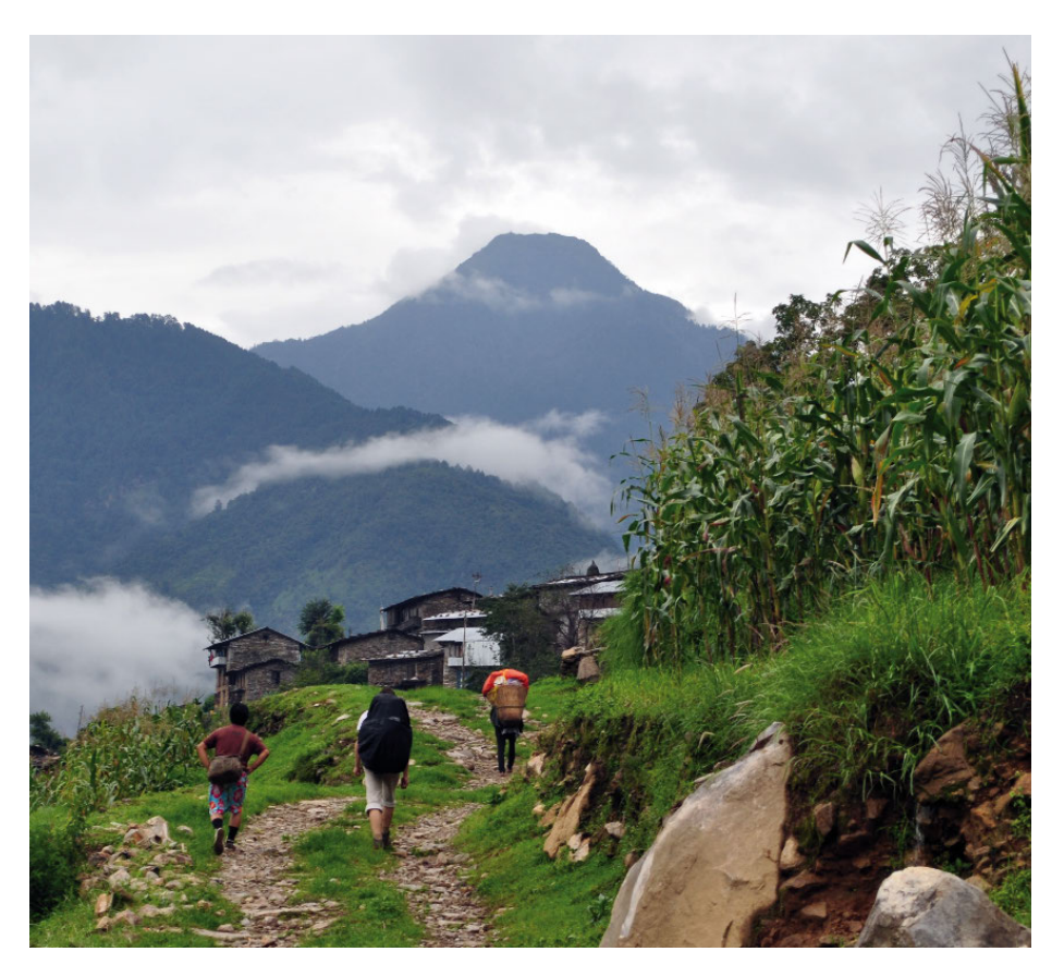
Fig. 4: gYang ri peak (3771 m) from the east