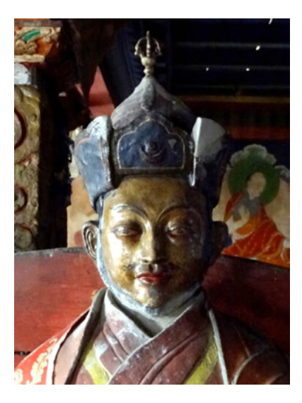
Fig. 3: gTer dbon Nyi ma seng ge's statue on the upper floor of Tarkeghyang Gonpa. In 2015 a big earthquake destroyed this temple