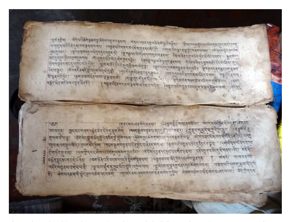
Fig. 2: The Melamchi Karchag mentions the temple built by gTer bon Nyi ma Seng ge, standing on gYang ri peak