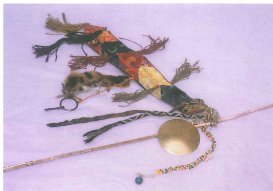
Fig. 146: Buchen Gyurme, who now lives in Dekyiling, North India, is one of the last mani lamas still active (Photo: Zsóka Gelle, Dekyiling, 1998)

thangka to show which part of the story they are speaking about. (Oral 1) (fig. 146)