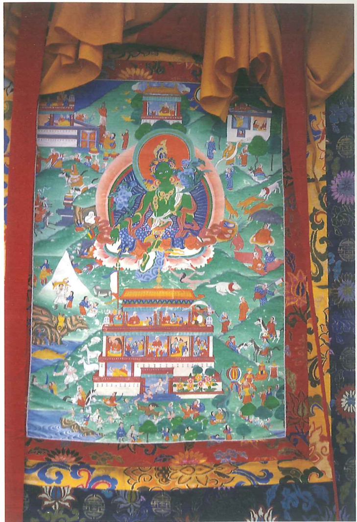
Fig. 151: The thangka of Dova Szangmo, property of Buchen Gyurme

The next thangka relates the story of Dakini Dova Szangmo (fig. 151), which ushers us into the world of a