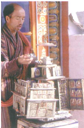
Fig. 144: Mani lama with tashi gomang of Buthan

According to the basic ideas of Buddhism, there is no greater honour than to spread the teachings of the Buddha and to indicate the path of enlightenment to those wandering in the darkness of ignorance. As the master of simple believers, the lama mani encourages listeners with his stories to live a virtuous existence, and reminds them of the Buddhist Law regulating everyday life. In order to multiply his merits, the lay practitioner offers a gift to the monastery, the lama, and the poor; he lights a devotional candle in front of statues of the deities, journeys to places of pilgrimage, walks round the holy objects, and asks the lamas for a blessing and an amulet. He strives to do good, in the knowledge of cause and effect, the law of the karma, the sufferings of rebirth in the six worlds ( srid pa'i 'khor lo ), the horrors of the underworld, and the judgment seat of the Lord of Death. He recites the mantras of various deities, or makes use of a prayer-wheel; among the mantras, that with the greatest cult is Chenrezi's (Avalokiteshvara) six-syllable mantra, the OM MANI PEME HUNG, which like all mantras aids meditation and the cleansing of the ego. The lama mani, who has received the Chenrezi initiation and is therefore the possessor of knowledge passed on from generation to generation, reinforces the importance of these actions in his listeners and explains the meaning of the six-syllable mantra.